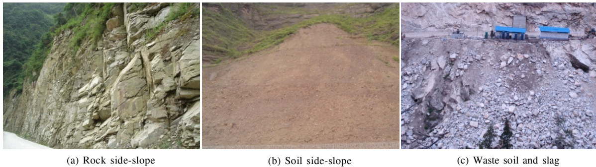
Fig. 1: The common types of disturbance.

practicability and operability, and the principle of dynamism and stability. According to these principles, the evaluation index system for eco-restoration engineering on the slope of a hydropower project is established, including four kinds of indexes. These are the effect of soil and water conservation, the effect of habitat material improvement, the effect of ecology and the effect of landscape. The evaluation index system is shown in Fig. 2.