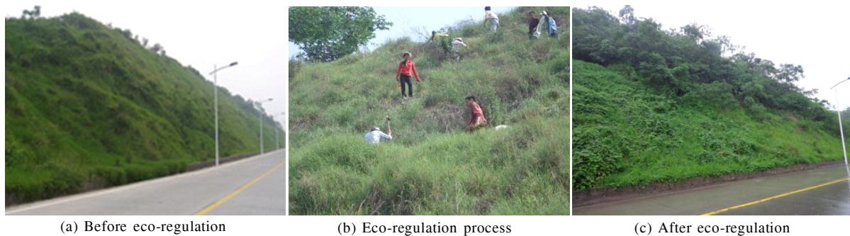
Fig. 3: Eco-regulation effect for Case IV

ral Science Foundation of the People’s Republic of China (Program SN: 51708333, 51678348), Open Research Program of Key Laboratory of Disaster Prevention and Mitigation, Hubei Province (Program SN: 2016KJZ13), Natural Science Foundation of Hubei Province (Program SN: 2016CFA085), Open Research Program of the Engineering Research Center of Eco-environment in the Three Gorges Reservoir Region of the Ministry of Education (Program SN: KF2016-05).